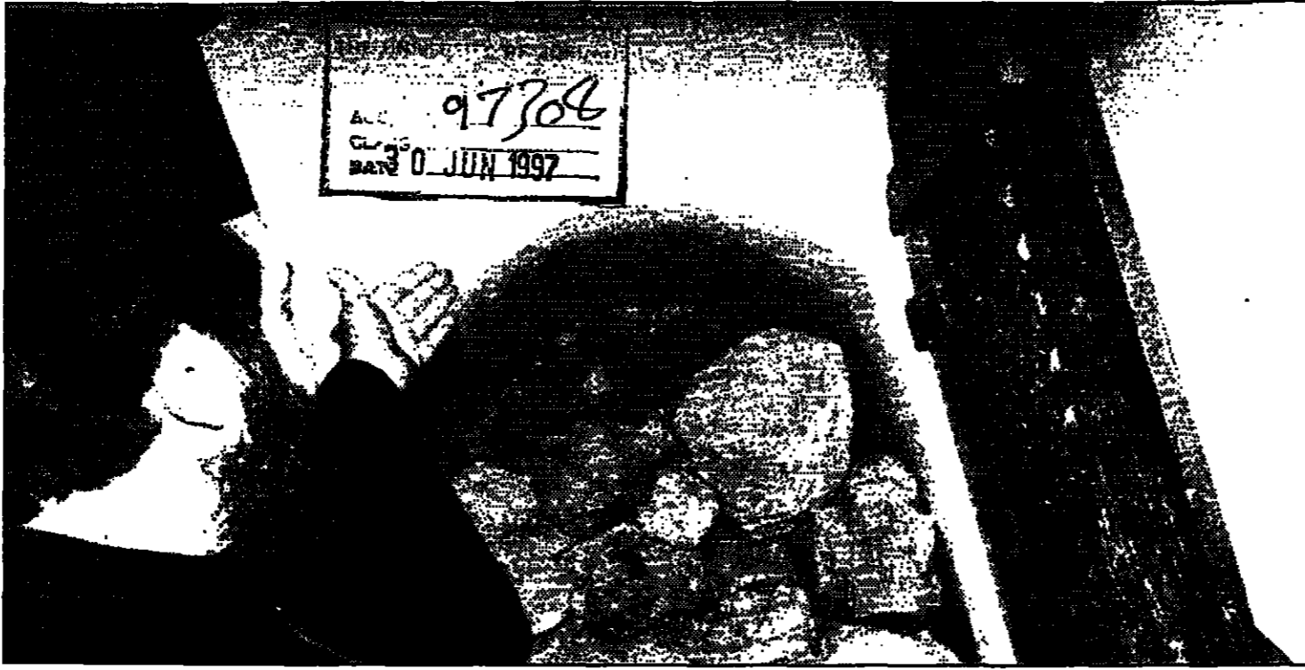
Greek Orthodox Archbishop Alexei points to the blocked entranceway of a room in the Church of the Holy Sepulcher yesterday. (Byron McBarney)

The tour revealed a maze of interconnecting structures, with rooms carved out of buildings representing different layers of history and often not serving their original function. On the Greek Orthodox side, one walked